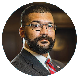
PHILLIP J. PAGE 6TH DISTRICT JUDGE, DIVISION 2