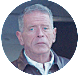
DALE LEWIS ROMANS U.S. SENATE DEMOCRAT