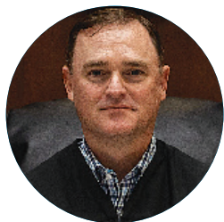
BRYCE CALDWELL 6TH CIRCUIT JUDGE, DIVISION 1