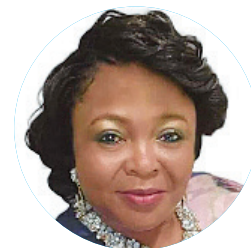
RHONDALYN RANDOLPH KENTUCKY HOUSE, DISTRICT 13 DEMOCRAT