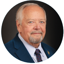
JIM GOOCH KENTUCKY HOUSE, DISTRICT 12 REPUBLICAN