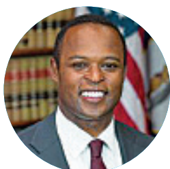
DANIEL CAMERON U.S. SENATE REPUBLICAN