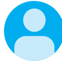
JOSHUA BLANTON SR. U.S. SENATE DEMOCRAT