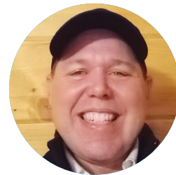
MIKE BLAN HANCOCK COUNTY MAGISTRATE/JUSTICE OF THE PEACE, 4TH DISTRICT REPUBLICAN