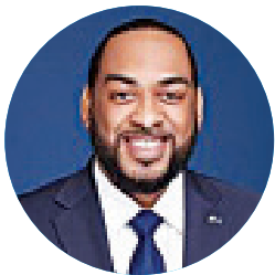
CHARLES BOOKER U.S. SENATE DEMOCRAT