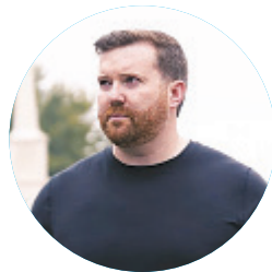
LOGAN FORSYTHE U.S. SENATE DEMOCRAT