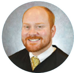
DANIEL BOLING 38TH DISTRICT JUDGE, DIVISION 2