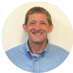
GARY BAKER HANCOCK COUNTY MAGISTRATE/JUSTICE OF THE PEACE, 4TH DISTRICT REPUBLICAN