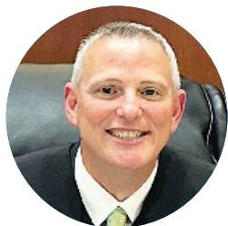
BRIAN L. QUATTROCCHI 6TH DISTRICT JUDGE, DIVISION 2