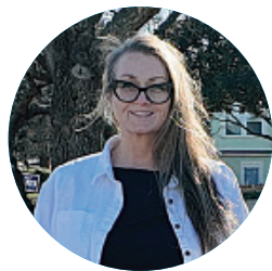
ANISSA CATLETT U.S. SENATE REPUBLICAN