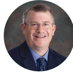
BRENT WIGGINTON HANCOCK COUNTY MAGISTRATE/JUSTICE OF THE PEACE, 1ST DISTRICT REPUBLICAN