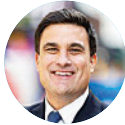
NATE MORRIS U.S. SENATE REPUBLICAN