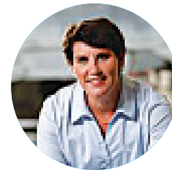
AMY MCGRATH U.S. SENATE DEMOCRAT