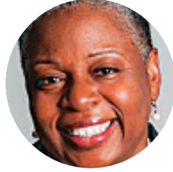
PAMELA STEVENSON U.S. SENATE DEMOCRAT