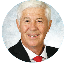
GARY BOSWELL KENTUCKY SENATE, DISTRICT 8 REPUBLICAN