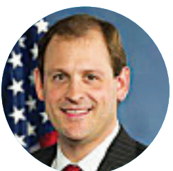
ANDY BARR U.S. SENATE REPUBLICAN