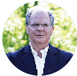
S. BRETT GUTHRIE KENTUCKY HOUSE, DISTRICT 2 REPUBLICAN