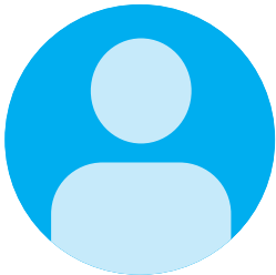
GEORGE WASHINGTON U.S. SENATE REPUBLICAN