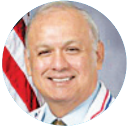
JIMMY I. LEON U.S. SENATE REPUBLICAN