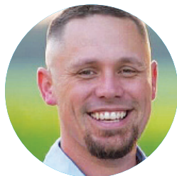
WES PATE KENTUCKY HOUSE, DISTRICT 14 REPUBLICAN