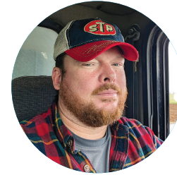
A. NICK SHELLEY U.S. SENATE REPUBLICAN